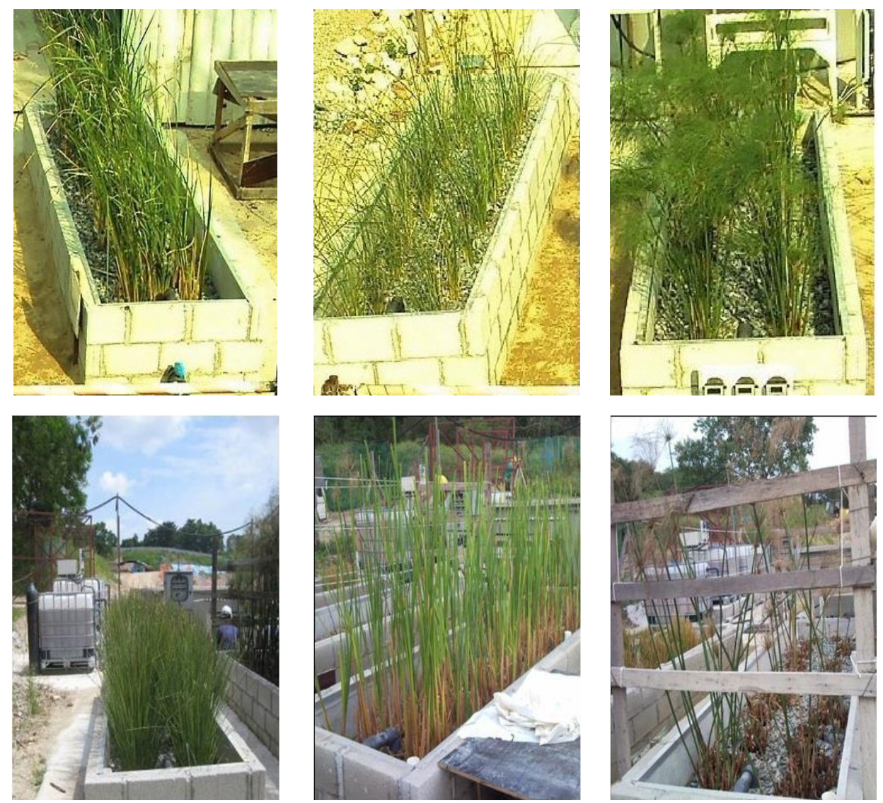
Figure 8: From left to right: Vetiver (C. zizanioides), Typha augustifolia and Cyperus papyrus at the start and the end of the treatment period