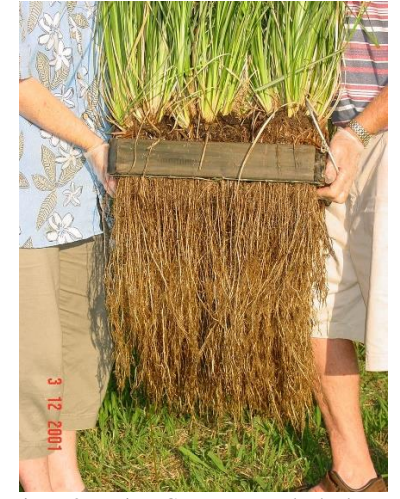
Figure 2: Vetiver Grass roots under hydroponics conditions