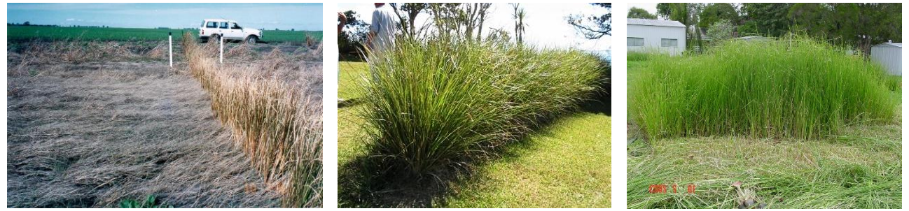
Figure 1: The erect, stiff shoots Vetiver grass forming a thick hedge when planted close together