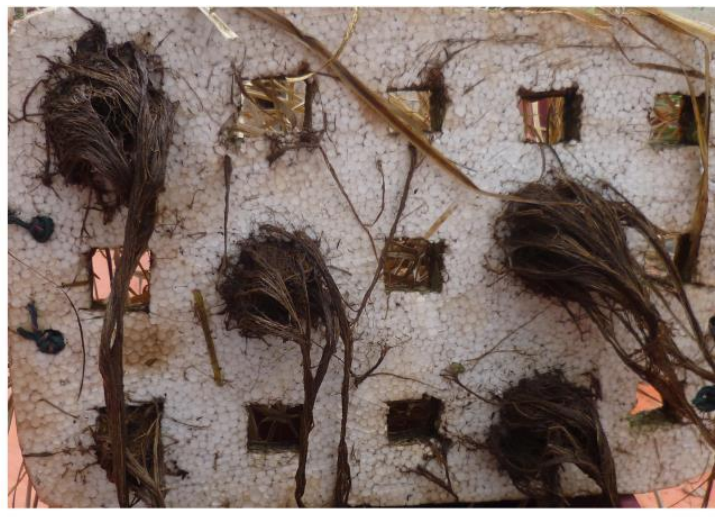
Dead root growth in anaerobic condition Figure 4: Healthy and dead Vetiver roots under aerobic and severe anaerobic conditions