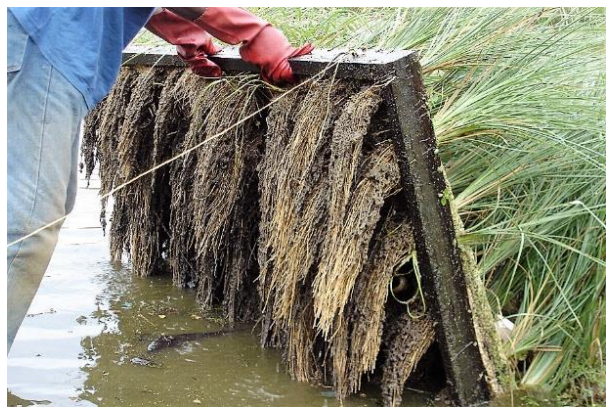
Figure 3: The root system of Vetiver grass in a polluted wetland under natural conditions

Litterature search between 1995 to 2019 on the use of different macrophytes for industrial and domestic wastewater treatment including pig farms, dairy farms, a sugar factory, textile mills, tannery, sewage effluent from municipal plant to septic tank, river and lake water showed that Vetiver was either equally and often more effective in treating the polluted wastewater than other macrophytes such as Cyperus alternifolius, Cyperus exaltatus, Cyperus papyrus, Phragmites karka, Phragmites australis, Phragmites mauritianus, Typha latifolia, Typha angustifolia, Eichhornia crassipes, Iris pseudacorus, Lepironia articutala and Schoenoplectus validus. Therefore, the main objective of this paper is to compare the effectiveness of Vetiver and other commonly used macrophytes for phyroremediating contaminated water in hydroponics and constructed wetland conditions.