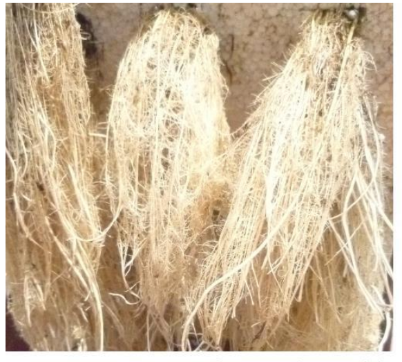
Healthy root growth in aerobic condition

Vetiver has a very high capacity of uptaking N and P in polluted water. Zheng et al, (1997) reported that the total N and P levels of the polluted river water (initial concentrations of 9.1 and 0.3 mg/L, respectively) were reduced by 71% and 98%, respectively, after 4 weeks of treatment. In small-scale glasshouse trials under hydroponics conditions, Vetiver takes up considerable quantities of both nitrogen and phosphorous (13,500 and 1026 kg/ha/year, respectively) higher than other plant species (Figure 5).